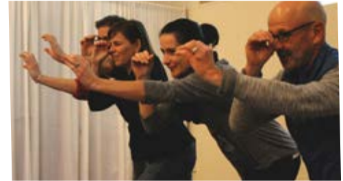
Teachers participate in an arts integration training institute.

Stay up-to-date at ArtCore's blog: http://www.artcorelearning.org