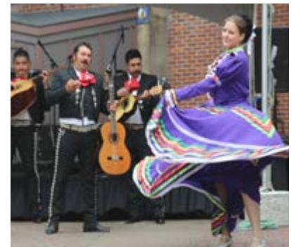
Fiesta Cultural kicked off during the ArtWalk with dancing and music in Kesey Square.

In regards to the kickoff event, a local artist shared, "In the 30 years I've lived here, that was the best downtown has ever been; that's what I've dreamed our town could be like."