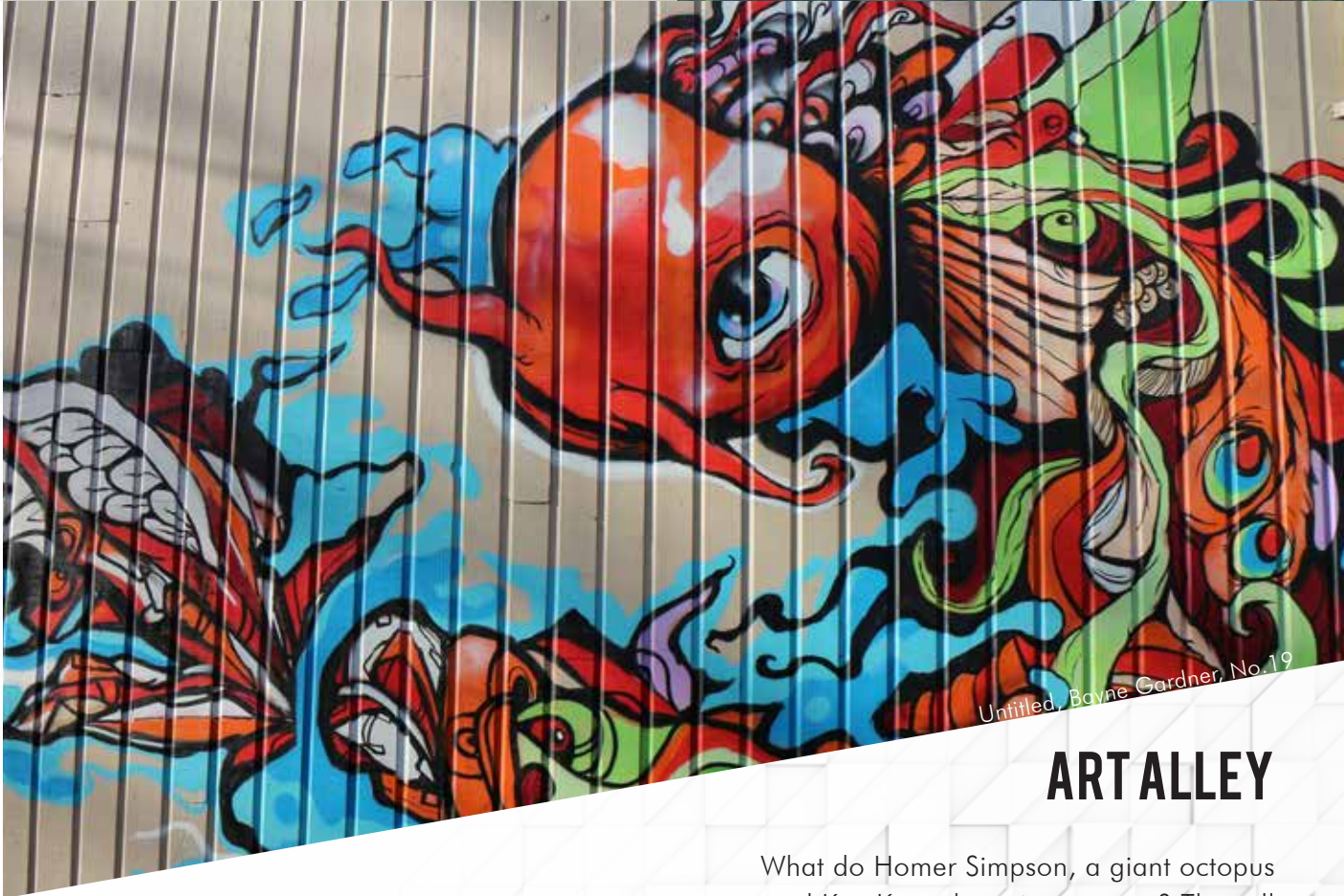
Untitled, Bayne Gardner, No. 19