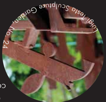
Luigi Testa Sculpture Garden, No. 24

The Springfield Arts Commission is an all-volunteer board committed to the belief that art is an important part of our shared identity and economic development. That's why we're passionate about promoting the arts, preserving our community's cultural heritage and supporting local artistic expression, exhibits, events and performances.