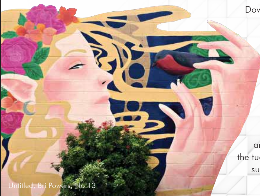
Untitled, Bri Powers, No. 13

What do Homer Simpson, a giant octopus and Ken Kesey have in common? They all loom larger than life over the streets of Downtown Springfield! Dubbed "Art Alley" for the density of works found there, downtown became an arts destination when the Springfield Arts Commission and City Council joined forces to sponsor seventeen pieces. A combination of public and private investment has since greatly expanded the number and type of works to be enjoyed in the area. From the towering murals to the storm drain art; the prominent outdoor sculptures to the tucked-away galleries in City Hall, you're sure to find Art Alley a feast for the eyes.