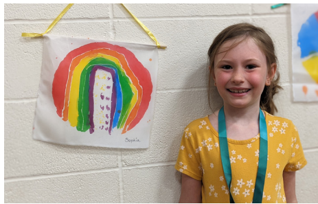
All About Art Summer Camp students proudly displayed their silk paintings on the final day of camp

Supporting the mental well-being and academic engagement of students returning to in-person learning was a top priority for school districts and Lane Arts Council this past year. After living through a time where so much felt outside of their control, Artist Residencies gave students an opportunity to author their own outcomes in the creative realm. Artist Residencies reached 6,284 students at 27 schools, 8 school districts, and 6 community organizations . 31 Teaching Artists led 2,707 hours of programming in classrooms exploring glass fusion, songwriting, painting, drawing, ceramic sculpture, dance, music, and much more. Of those served, 19 schools were rural or primarily low income including schools in Oakridge, Siuslaw, and South Lane.