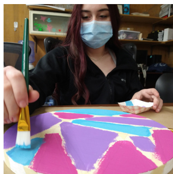
Students working in our Creative Link program at Twin Rivers learned to follow through with long term projects