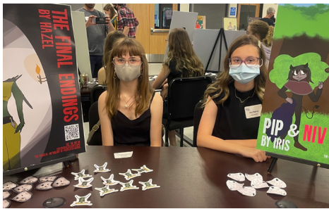
Students created posters in Digital Illustration, one of the many mediums of design offered through our Design Arts Apprenticeship program

Our Design Arts Apprenticeship program paired 90 students with professionals in the fields of art and design. Students from 30 schools in Bethel, Cottage Grove, Creswell, Eugene, Fern Ridge, and Springfield explored graphic design, digital storytelling, 3D printing, up cycled fashion design, bio-mimicry, screen printing, custom furniture design, printmaking, vinyl sticker design, and product design. Each term concluded with a showcase where students confidently displayed and explained the process of their creations. Design Arts Apprenticeships help students explore creative career fields and learn through direct experience. 85% of participants gained a professional reference and 67% said they felt more prepared for a future job or career.