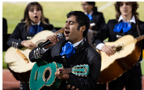
As part of Fiesta Cultural, Springfield High School's Mariachi del Sol played at a Siuslaw High School football game in Florence

Fiesta Cultural kicked off during the September ArtWalk with music, dancing, Windowfront Exhibitions, visual arts, and Mariachi music in the streets, bringing 1,000+ participants downtown after two years of scaled back events. Through Fiesta Cultural, Lane Arts Council promoted or directly supported over 50 community events in Eugene, Springfield, Cottage Grove, and Florence. The variety of events represented a wide breadth of Latino/a/x/e arts and cultures here in Lane County and included art exhibits, book readings, bilingual storytimes, Día de los Muertos celebrations, Latin dance, a block party, Charro demonstrations, workshops, performances, and so much more.