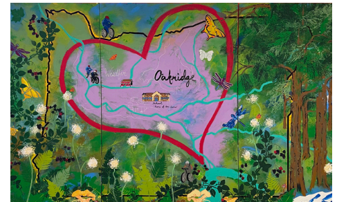
Mural at Oakridge Elementary School