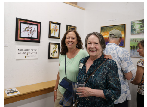
First Friday ArtWalk patrons visiting The New Zone Gallery

A new partnership with Lane Transit District featured the Ride, Read, and Rock the Block Party at the August First Friday ArtWalk. ArtWalk Patrons hopped aboard a LTD shuttle to explore downtown Eugene. LTD continues to provide free bus passes every first Friday of the month to encourage ArtWalk attendance. The ArtWalk continues to see new venues and artists participating each year!