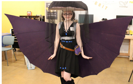
Design Arts Apprenticeship student displaying their fashion design concept