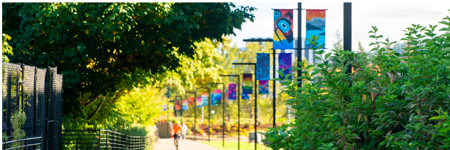
Cultural Currents pole banner installation, designed by TEAK | Patrick Price, lines Riverfront Park pathways