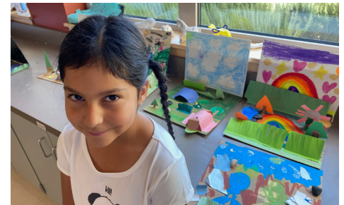
Migrant Education Program student with their paper collage design