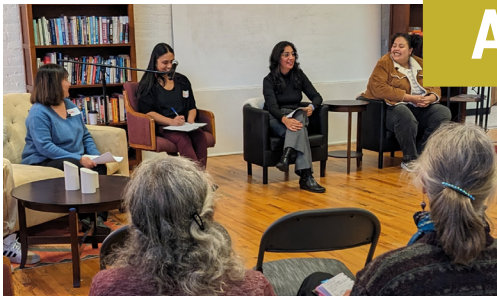
Panelists answer question during the Fall Roundtables discussion

$274,638 paid to 132 artists in our community