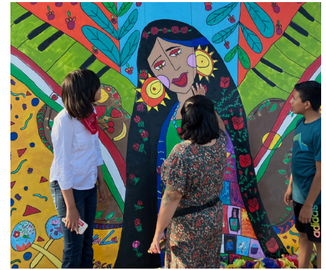
Mural designed and painted during Migrant Education Program summer learning

well as designed a large-scale mural. After studying public art and the murals celebrating Latin cultures and identities, they met with two local Latino muralists who talked with students about their journeys as professional artists. The students then designed and painted a mural that focused on the importance of music in their cultures and families. The completed mural is now installed in the Migrant Education office at Lane Education Service District. The month-long summer collaboration ended in a "Mercado," or marketplace, where students celebrated with family and friends.