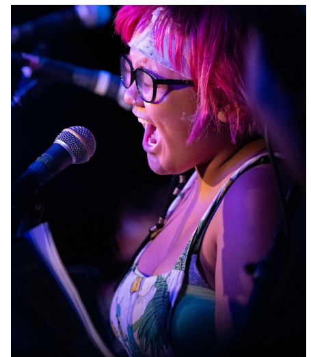
Youth performer at Music's Edge Rock Camp, a 2023-24 Community Arts Project Grant recipient

In partnership with a committee of community members, Lane Arts Council hosted five workshops focused on equity in our arts and culture communities. These hybrid in-person and virtual workshops drew 84 participants from 11 cities around Oregon. Roundtable discussions engaged dialogue around ways to foster equitable, inclusive, and respectful cross-cultural collaboration. The spring and fall series explored the impacts of structural racism, aiming to reduce division and flourish in the strength of our diversity by delving into historical exclusion and engaging in dialogue about our collective and individual roles in shaping a better future. Events opened with an artist share and engaged participants in conversations around arts activism, cultural storytelling, cross-cultural collaboration, and social justice-oriented artistic work.