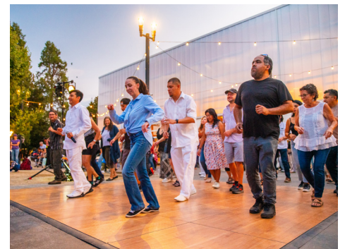
Community members participating in salsa lessons during Fiesta Cultural at the First Friday ArtWalk