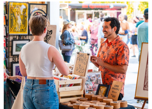
Artist selling work at Fiesta Cultural