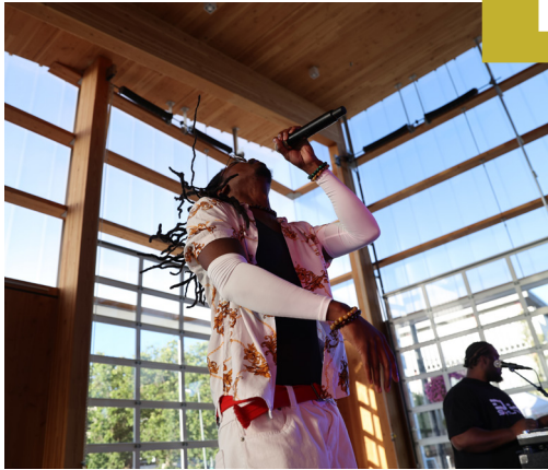
The Block is Hot performance at the Farmers Market Pavilion during July First Friday ArtWalk

This financial summary, reviewed by Emge & Whyte, Certified Public Accountants, represents the 2022-23 fiscal year.